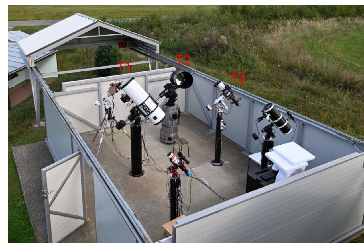
Figure 2: 3 of 9 telescopes are operated in the new pavilion at the Astronomical Observatory in Kolonica Saddle, eastern Slovakia.