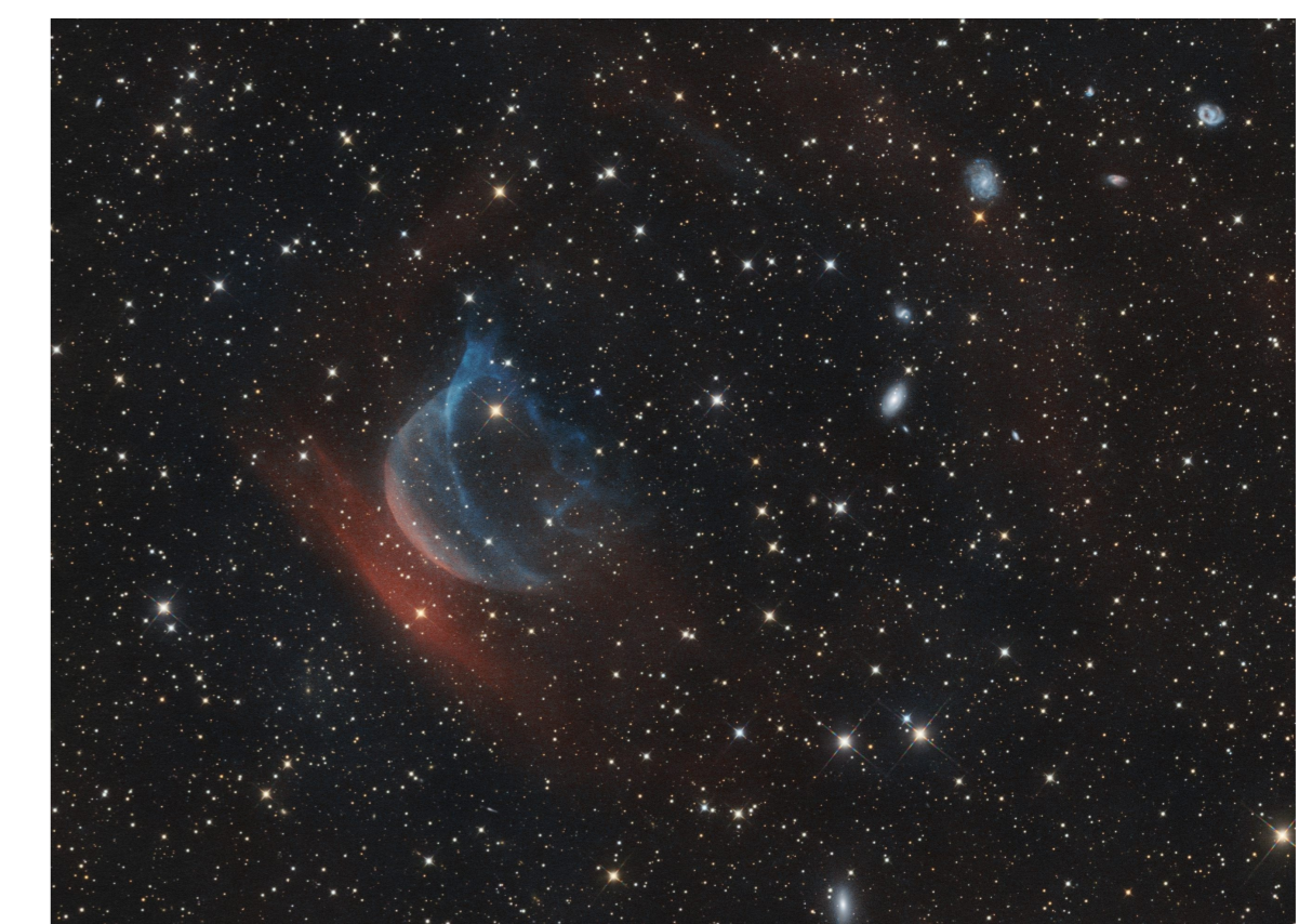
Figure 3: Result of the pilot campaign on the nova shell of Z Cam. Red color corresponds to H\alpha emission, blue comes from [OIII] band.